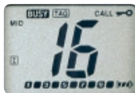
The photo shows actual display size.

* 35x24 mm dimensions; To show the S-meter, set in set mode.